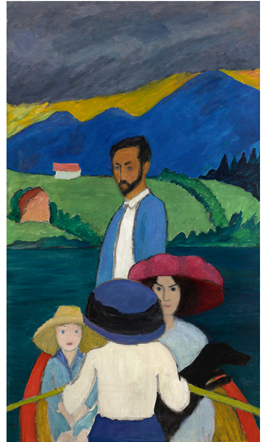
Figure 4. Gabriele Münter (German, 1877–1962). Boating, 1910, oil on canvas, Part of the Bradley Collection of Modern Art at the Milwaukee Art Museum.

Another one of Münter’s famous early works, Boating (Figure 4), also contains details revealed with infrared imaging. The wide hat of the woman facing the viewer is quite unnaturally asymmetrical on the original. To improve this, part of the hat on the right side was covered up to balance the hat a bit better, see Figure 5.