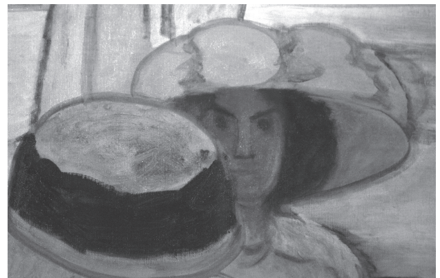
Figure 5. Boating. Combination of 1650 nm and 1200 nm wavelength images indicate that the right side of the hat was originally even wider, but reduced and painted over in the final composition.

It is interesting to observe compositional changes in both Girl with Doll and Boating given that these works were created right around the time Neue Künstlervereinigung München was created. Since Münter was very much experimenting with new techniques and styles during this time period, it makes sense that these paintings would have compositional changes. With the RevealScan-M, we are offered a peak into Münter’s creative process, during the ascension of her signature style as an artist.