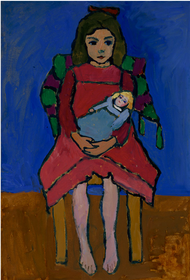
Figure 1. Gabriele Münter (German, 1877–1962). Girl with Doll (Mädchen mit Puppe) , 1908–09. Part of the Bradley Collection of Modern Art at the Milwaukee Art Museum.

Gabriele Münter (1877-1962) was a German expressionist painter. Around the early years of the 1900's Münter studied under, then later collaborated with, the Russian painter Wassily Kandinsky. She became active in the German art scene immediately preceding the outbreak of World War I, particularly as a founding member of the groups Neue Künstlervereinigung München and Der Blaue Reiter 1 . The Münter paintings scanned are part of the Bradley Collection of Modern Art, organized into a special exhibit celebrating the 50th anniversary of the collection at the Milwaukee Art Museum. The paintings were left in place on the wall at the exhibit and scanned in situ during a time when the exhibit was closed to the public 2 .