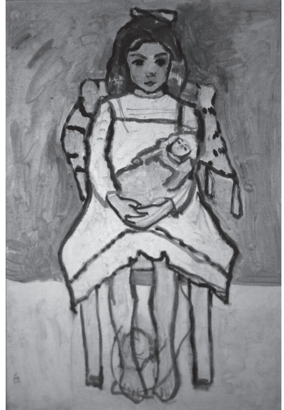
Figure 2. Girl with Doll . The infrared image captured with the RevealScan-M shows an underdrawing at the bottom of the painting partially concealed beneath the girl's feet.

Capturing Münter's work with the RevealScan-M multi-range, multispectral camera uncovers some surprising details in her early expressionist compositions. In one of the Münter paintings analyzed, Girl with Doll (Figure 1), there are a few black streaks visible in the painting near the girl's feet, invisible by just inspecting the painting. Looking at the infrared reflectance images captured by the RevealScan-M however, the streaks by the girl's feet turn out to be part of a face that was painted over in the final painting, see Figure 2. Rotating that image 180° as in Figure 3, the face is that of the same girl with a bow in her hair. The similarity between this outline and the girl in the painting suggests Münter started drawing the girl in partial profile, was likely unhappy with the outline, and flipped the canvas to start over.