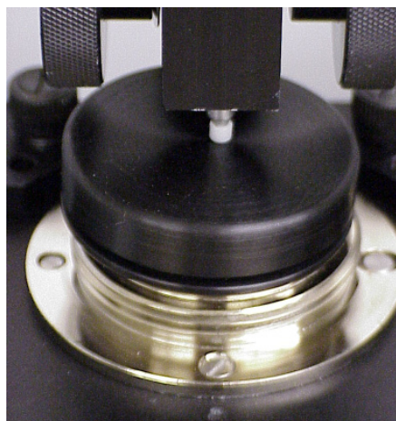
ATR accessory pressed at functional pressure on ATR Validation Standard.

The reproducibility of the ATR measurements is excellent as shown on the chart below.